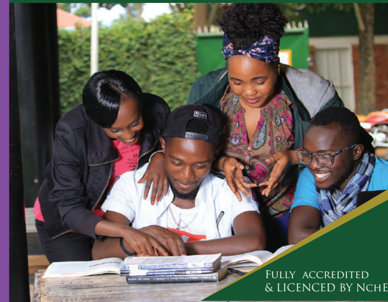
FULLY ACCREDITED & LICENCED BY NCHE