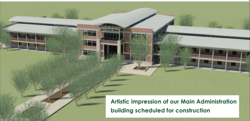
Artistic impression of our Main Administration building scheduled for construction

LivingStone International University (LIU) is a private non-profit Christian University established in Mbale, Uganda. The vision comes from the missionaries of the New Testament Churches of Christ who saw the need to have a greater influence through education so that communities can be impacted for Christ. LIU was granted a letter of interim authority by the Uganda National Council for Higher Education to begin operating in 2008. In March 2010, after vigorous inspections and interviews, a provisional license was granted, which authorizes LIU to admit students and issue degrees. The process of acquiring the Charter is in progress. All degrees have been accredited by NCHE and we look forward to future expansion as God provides. LivingStone International University is seeking to transform Africa through quality Christ-Centered Higher education and the LIU vision is taking shape rapidly with much work to be done. Already, 46 acres have been acquired in a key location on the Mbale to Jinja highways near Mbale. The permanent campus plan development is made up of modern, pristine buildings as part of a master plan designed by Engineering Ministries International to accommodate student growth to 4,000 over 15 years. The university opened the doors to its first class on January 16, 2012 on a campus in Mbale.