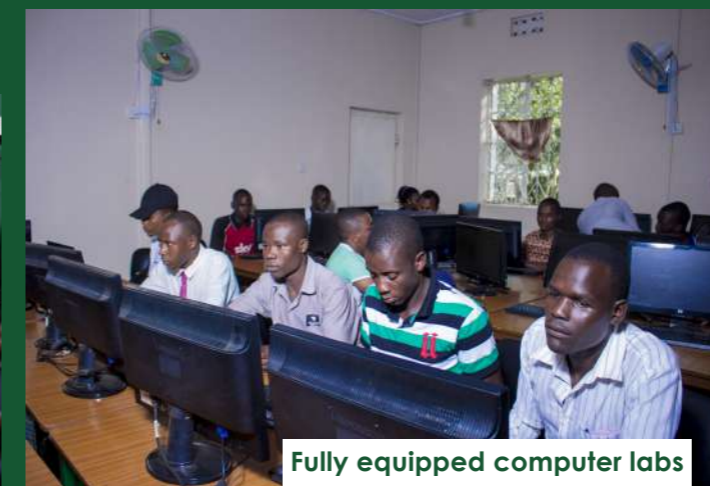
Fully equipped computer labs

Students are prepared to provide technological learning leadership and create innovative solutions to global challenges.