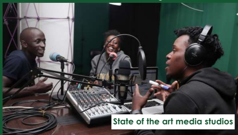
State of the art media studios

Our fees policy ensures students are not unduly distracted from their primary function – learning.