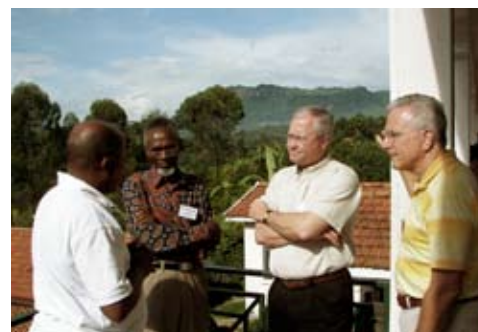
African leaders shaped the vision.

of what it has taken to get us this far is highlighted by these happenings: