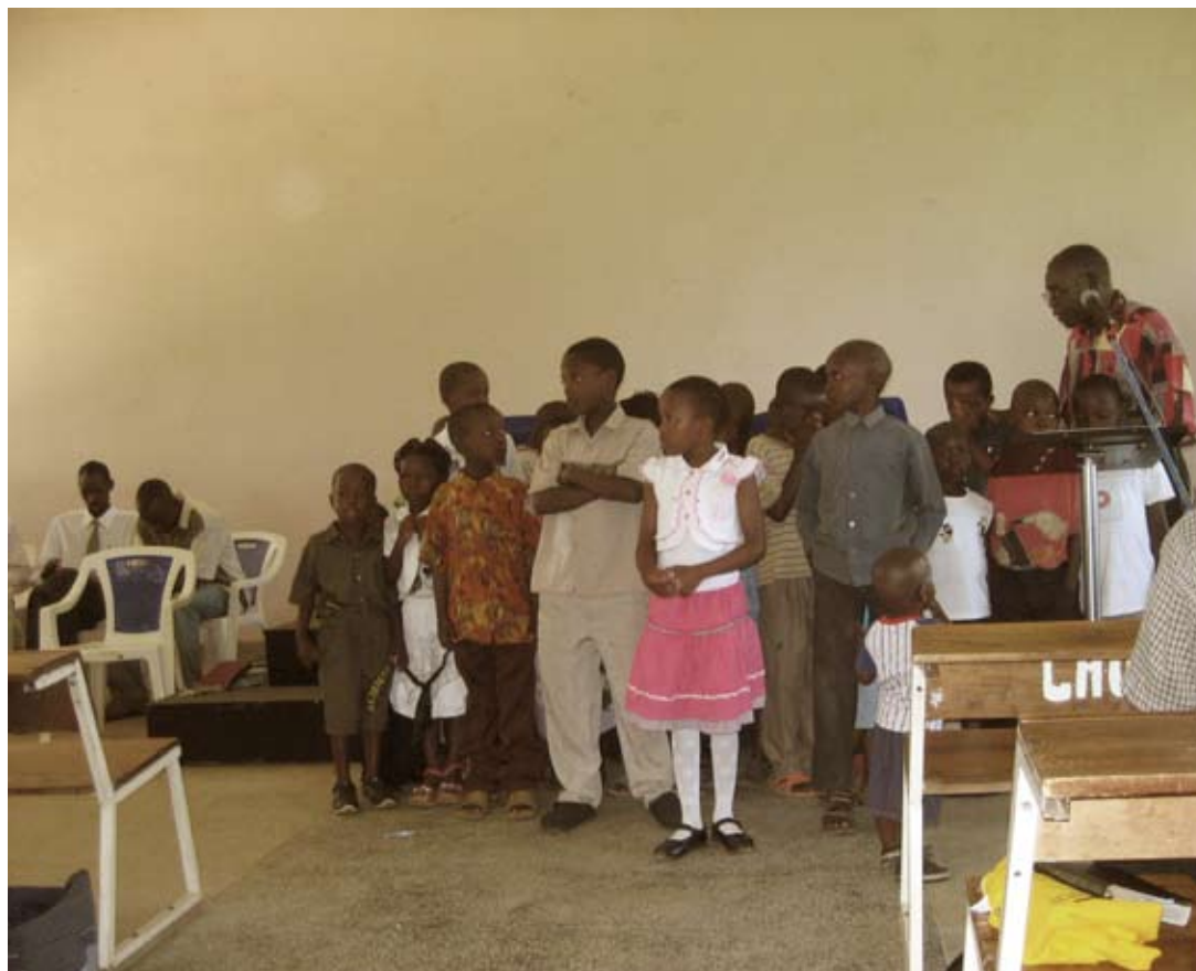
Ugandan universities only have room for 4 of every 1,000 children.