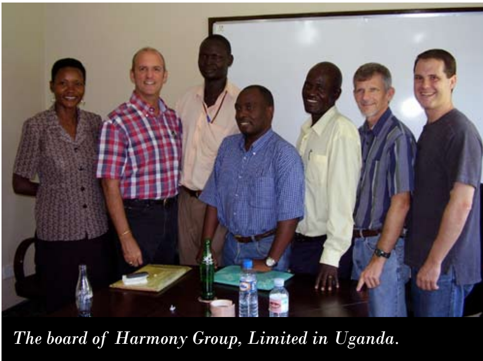
The board of Harmony Group, Limited in Uganda.

The growth of the university will be controlled as it grows by 100 students per year. Eventually LIU will have a student body of 4,000.